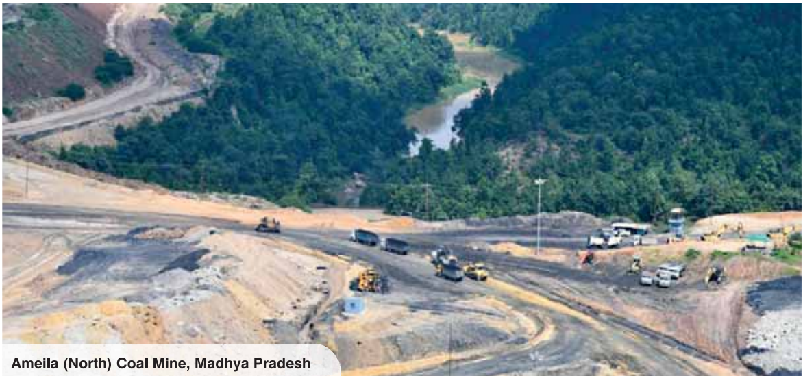
Ameila (North) Coal Mine, Madhya Pradesh