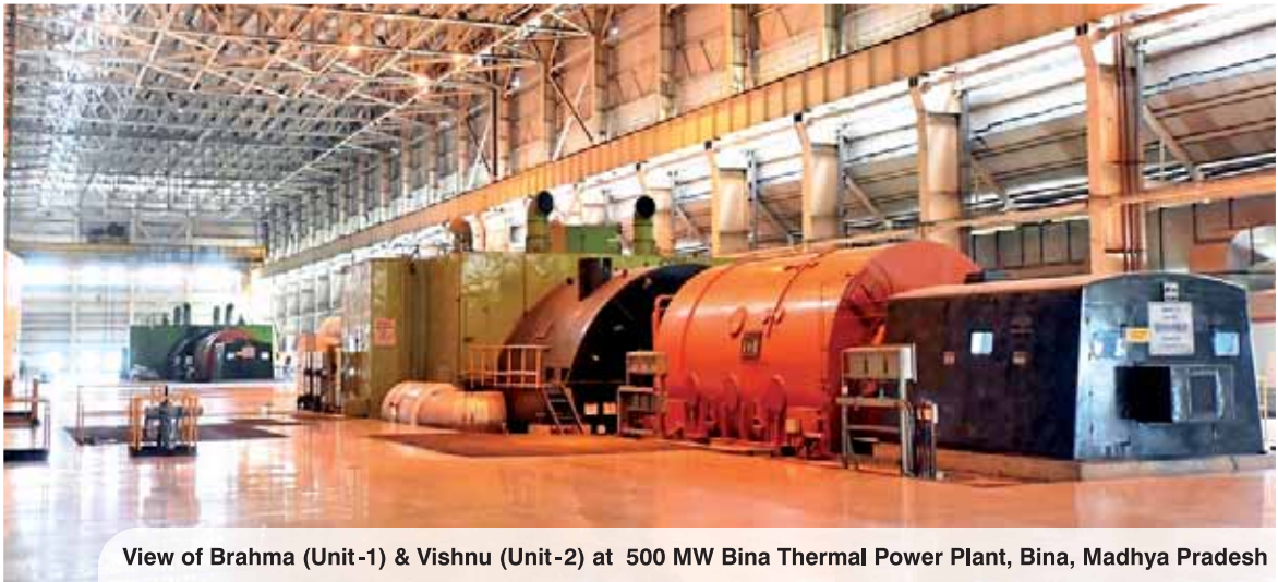
View of Brahma (Unit-1) & Vishnu (Unit-2) at 500 MW Bina Thermal Power Plant, Bina, Madhya Pradesh