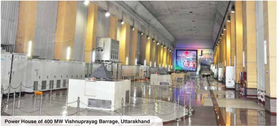
Power House of 400 MW Vishnuprayag Barrage, Uttarakhand