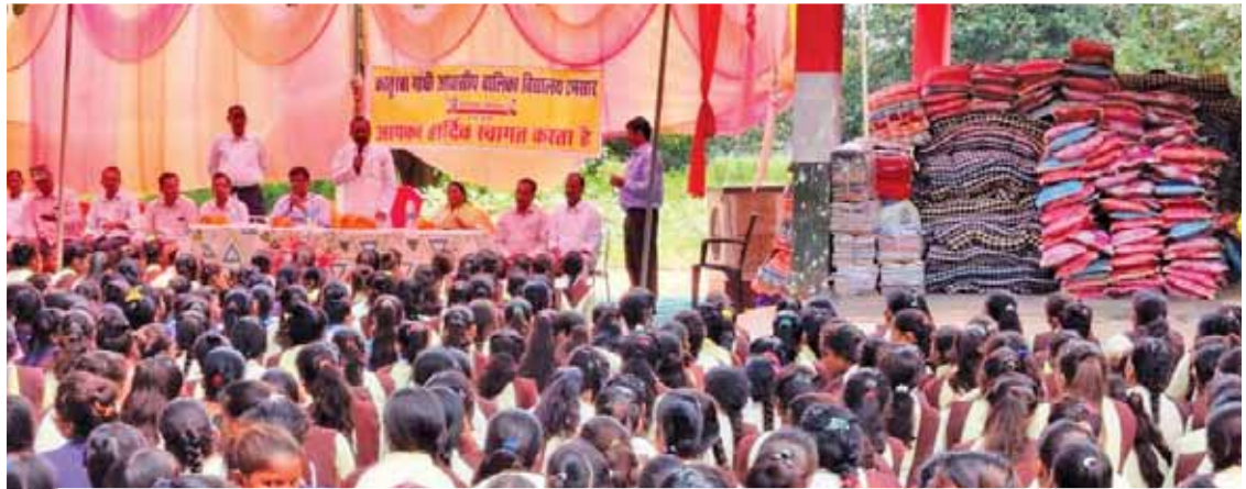
Mattress, Blanket, Bed Sheet & Pillow Distribution at Kasturba Gandhi Awasiya Balika Vidyalaya Tamsar at Nigrie, Madhya Pradesh