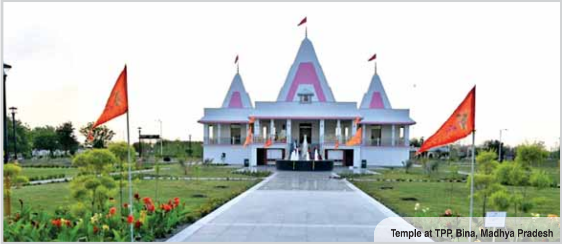
Temple at TPP, Bina, Madhya Pradesh