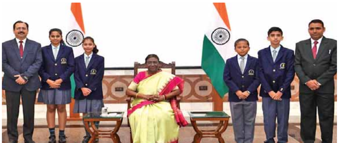
Teachers & Students of SPHSS with Hon'ble President of India on the occasion of Children's Day 2023, Bina, Madhya Pradesh